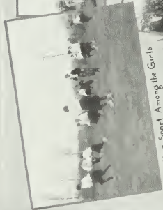
A Leading Sport Among the Girls